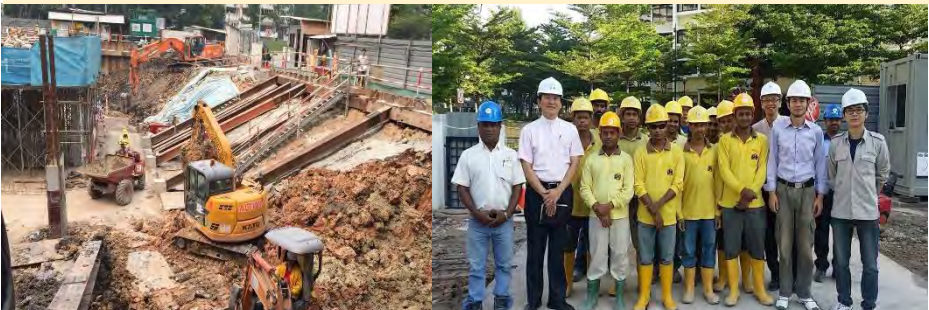
Construction work in progress.

Give thanks to God for the capable team of construction workers.