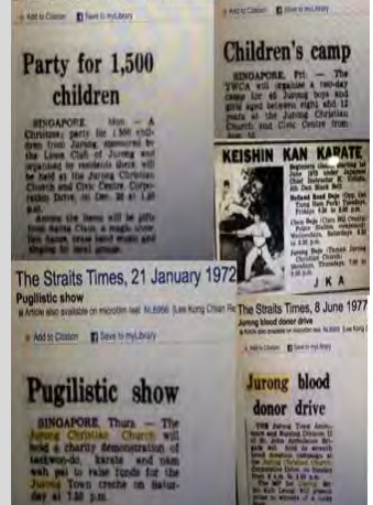
The Straits Times, 15 December 1970 The Straits Times, 10 July 1971 Party for 1,500 children Children's camp

We dropped the CIVIC CENTRE part of our original name in 1971 at the instruction of the Registrar of Societies and became simply known as JURONG CHRISTIAN CHURCH. Nevertheless, we have never stopped our active engagement in useful ways with the community.