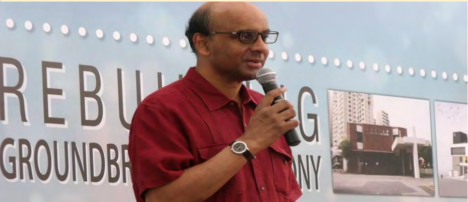
Mr Tharman Shanmugaratnam, Deputy Prime Minister of Singapore, at our Rebuilding Ground-breaking Ceremony on 24 th Jan 2015.