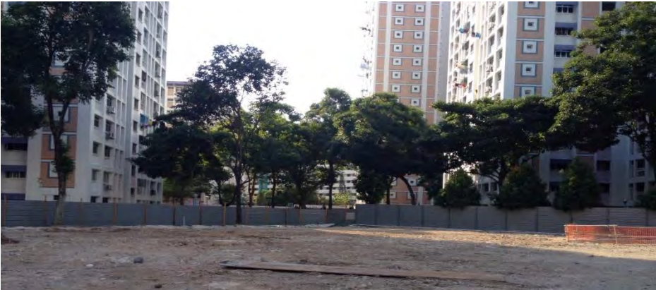
Land at 2 Tah Ching Road cleared for new building.